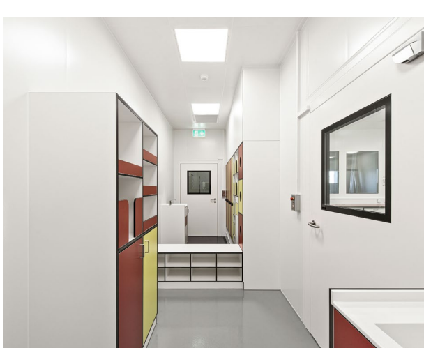
Raumedic Helmbrechts, Germany

In addition to the supply of high quality products, we can gladly assist you with GMP qualification or technical aspects, such as statics, fire protection or sound insulation. Should you so desire, our experienced fit-out crew can also deal with the installation of a wide variety of clean room systems. And we don't consider that our service necessarily ends with completion of the project: We can also assume responsibility for maintenance work or provide you with other services.