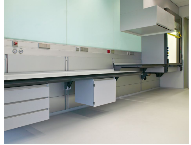
Netherlands Forensic Institute (NFI) Den Haag, Netherlands