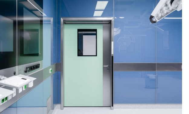
KRH Hospital Siloah Hanover, Germany