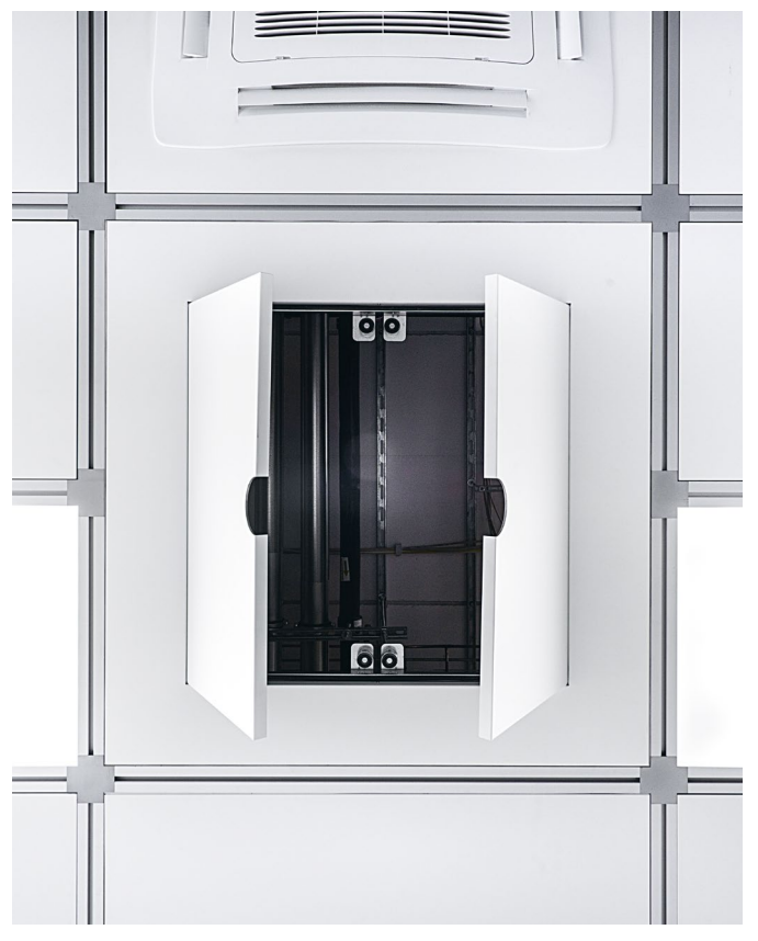
European XFEL, Research Campus Schenefeld Hamburg, Germany