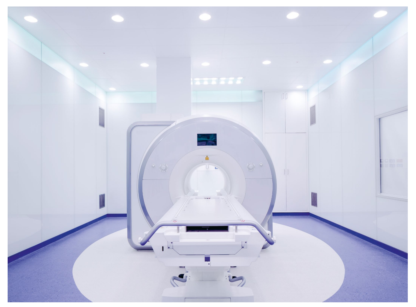
Hamad General Hospital Doha, Qatar

We are available to you as an experienced partner in every phase of your project. Numerous highly specialised professionals and innovative technologies enable the implementation of even the most extraordinary designs.