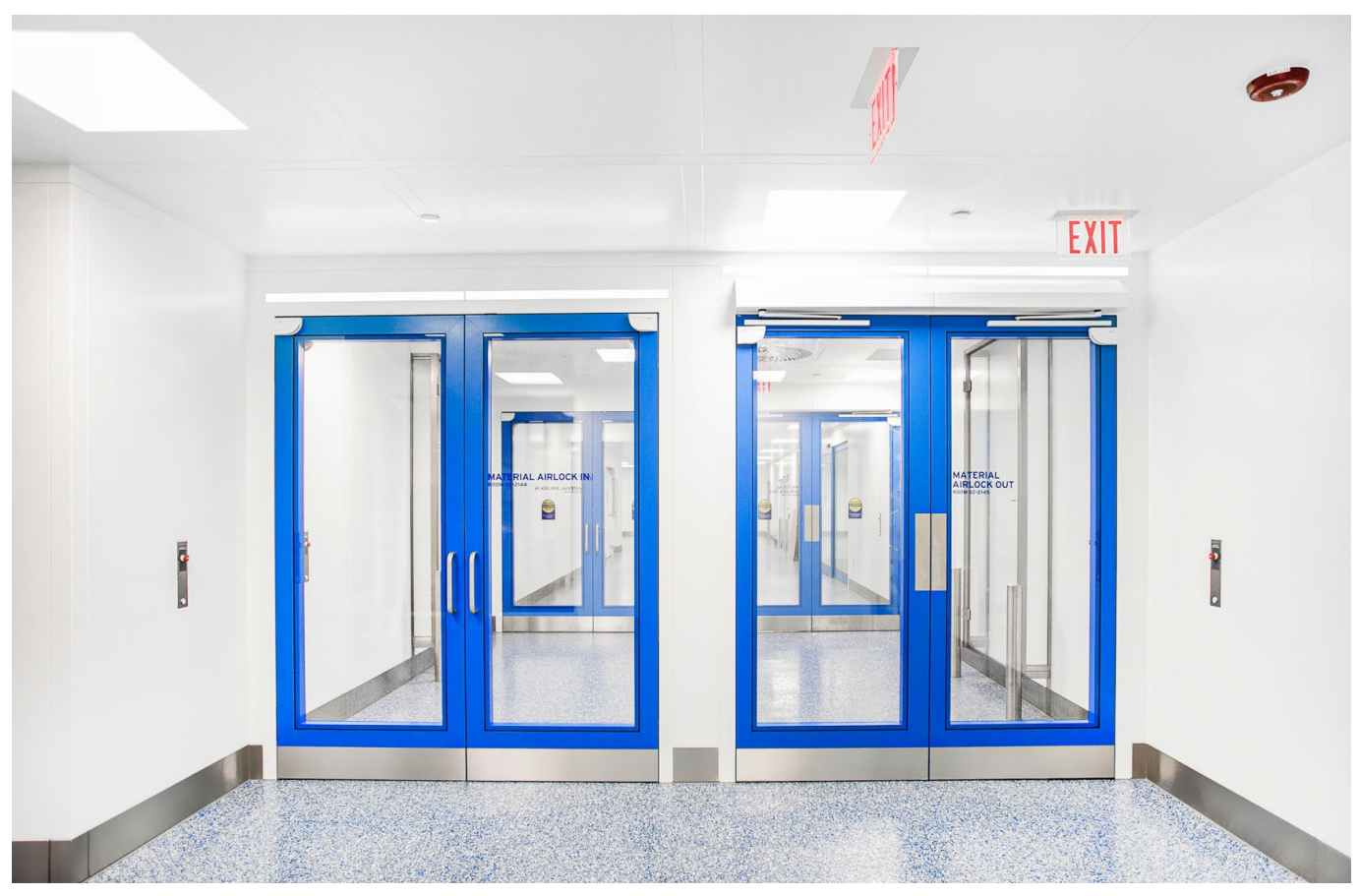
Fresenius Kabi USA LLC, Melrose Park, Illinois, USA