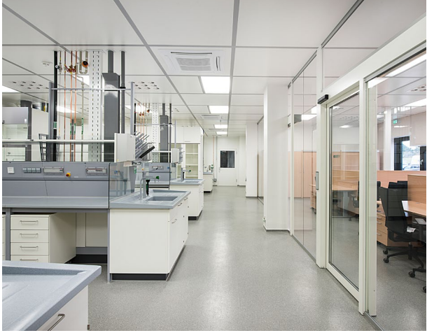
European XFEL, Research Campus Schenefeld Hamburg, Germany