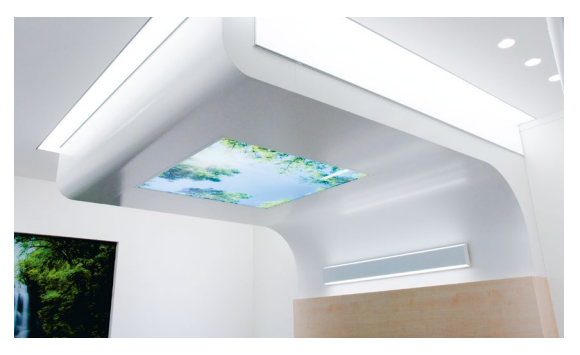
Futuristic patient room Arnstorf, Germany