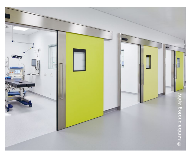
Hornheide Specialist Clinic Münster, Germany