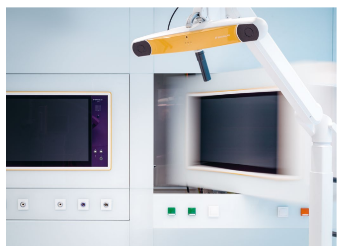
Brainlab Headquarters, Tower Riem Munich, Germany