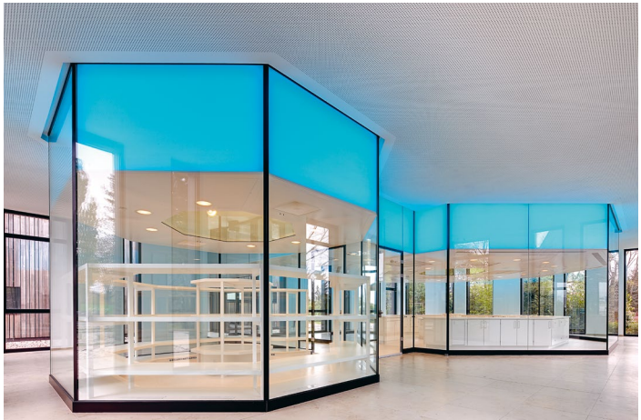
Laboratory Soluna Heilmittel Donauwörth, Germany